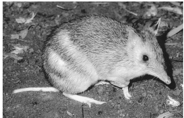
FIG. 1. Adult male Perameles gunnii at Hamilton, Victoria.

Head and dorsum are grizzled, yellowish brown; erect, sharp ears are similarly colored. Bars on hindquarters are white to pale