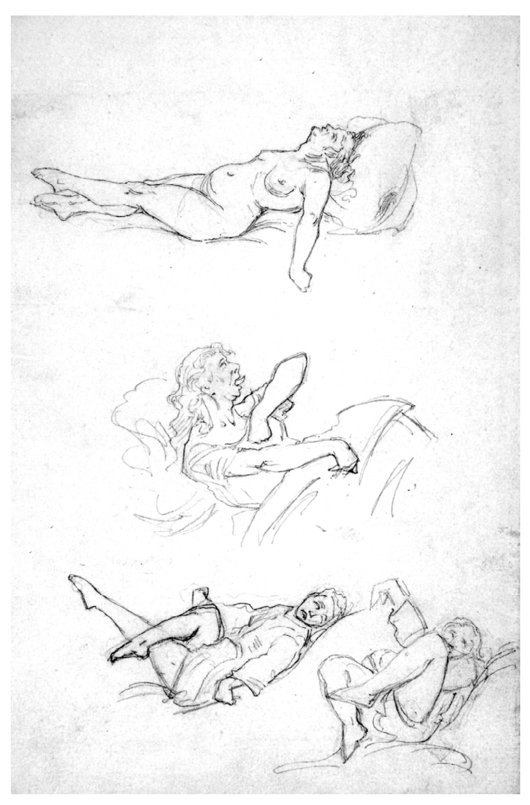
Figure 4 Original graphite sketches by Paul Richer, drawn at patients' bedsides in La Salpêtrière Hospital. 1879.

local sign of hyperaesthesia: "It may be concluded that the ovary, and the ovary alone, explains the fixed iliac pain of hysterics" (6). It was not until 1882 that he defeminised hysteria by reporting cases in men. In 1879,