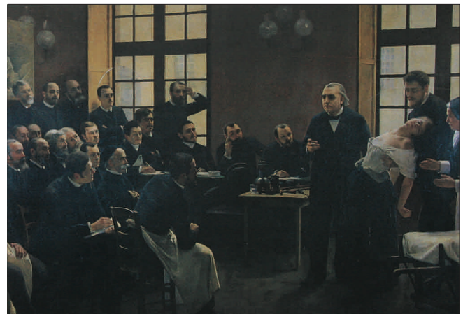
Figure 4: Une Leçon Clinique à la Salpêtrière (“A Clinical Lesson at the Salpêtrière”) by French painter André Brouillet (1887), featuring both Gilles de la Tourette (sitting in the first row, wearing a white apron) and Charcot (standing next to the patient)