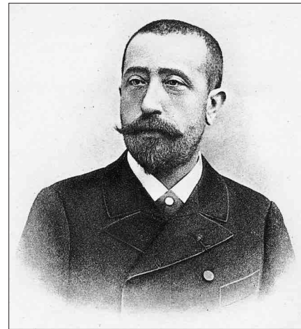
Figure 2: Georges Gilles de la Tourette (1857–1904)

Gilles de la Tourette studies medicine at the University of Poitiers before moving to Paris in 1881. In 1884, he was invited by Jean-Martin Charcot to join his department at the Salpêtrière Hospital in Paris. In the same year, Charcot asked him to “bring