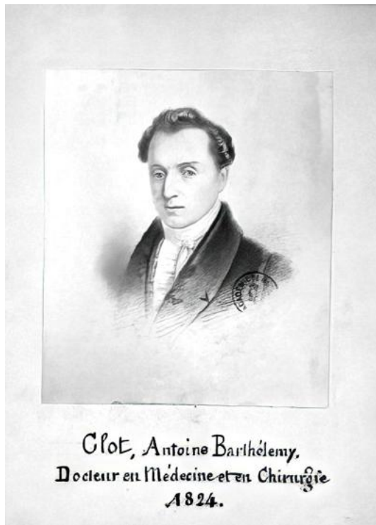
Fig. 1 – Portrait of Antoine Clot in 1824.