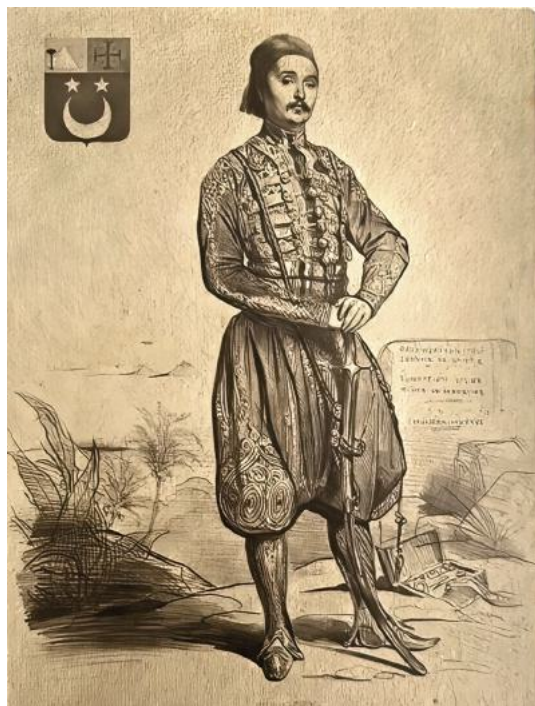
Fig. 3 – Clot-Bey, inspector general of the health department in Egypt.

infection, notably tuberculous infection, his perspicacity as a clinician made it possible for him to describe two cases potentially comparable to those that, a century later, Georges Guillain, Alexandre Barré, and André Strohl would call “a syndrome of radicular neuritis with hyperalbuminosis of the cerebrospinal fluid without cellular reaction”. Like the Scottish Abercrombie, Clot can be recognised as a pioneer in the study of spinal cord pathology [23].