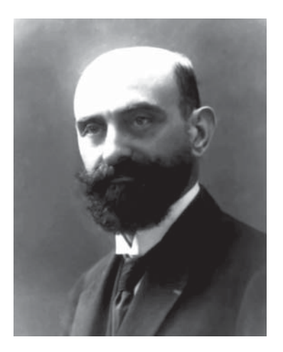
Fig. 2. René Cruchet (1875–1959) (private collection).

Like many of their colleagues, Guillain and Barré performed an in-depth study of spinal cord injuries. The considerable mortality associated with these injuries led the pair to emphasise early management, including systematic surgical ex-