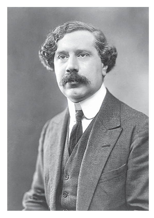
Fig. 5. Charles Foix after the war.

Foix was promoted to médecin major de 2e classe in April 1918 and was finally assigned in September 1918 to Zeitenlik Hospital No. 2, the Salonika neurology centre [41].